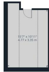
First Floor Building 2